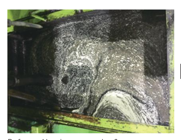
Before: Aluminum powder floats on top of water tank.