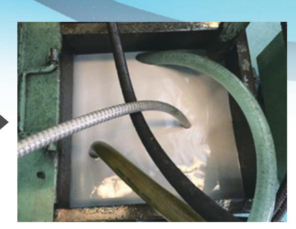
After: Both carbon powder and oil floats have been removed.