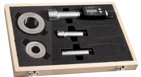
SXTD5M standard set